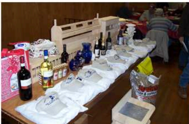
Raffle table filled with goodies